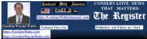
image005.png ~50 KB