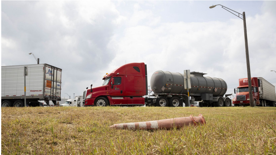
Trucks wait to be inspected by Texas State troopers at an inspection site close to the recently reopened Pharr-Reynosa International Bridge, following the end of a blockade by drivers in Mexico in April to protest of the border inspection policy imposed by Texas Gov. Greg Abbott.

In November, Abbott had a slightly larger approval rating of 52% for his policies at the border. Among Latino voters, that approval weakened to 45% and, for Black voters, to 28%. But 61% of non-Hispanic white voters supported Abbott's handling of immigration at the border.