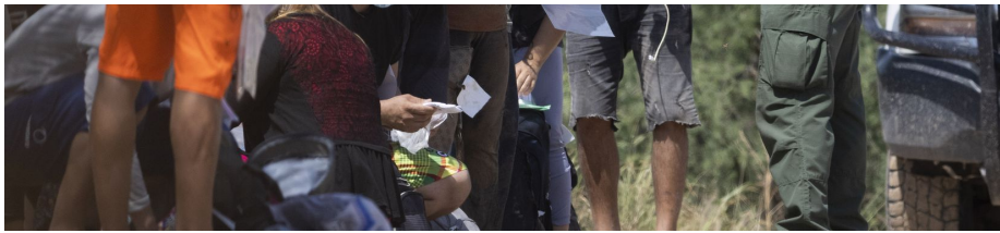
A group of mostly Cuban migrants are handed bags for their belongings by Border Patrol agents after crossing the Rio Grande River from Mexico into the U.S. in May along the border wall in Eagle Pass. A new Dallas Morning News/UT-Tyler poll shows support for Gov. Greg Abbott's policies at the border.

Follow This Story Get Personalized News Updates