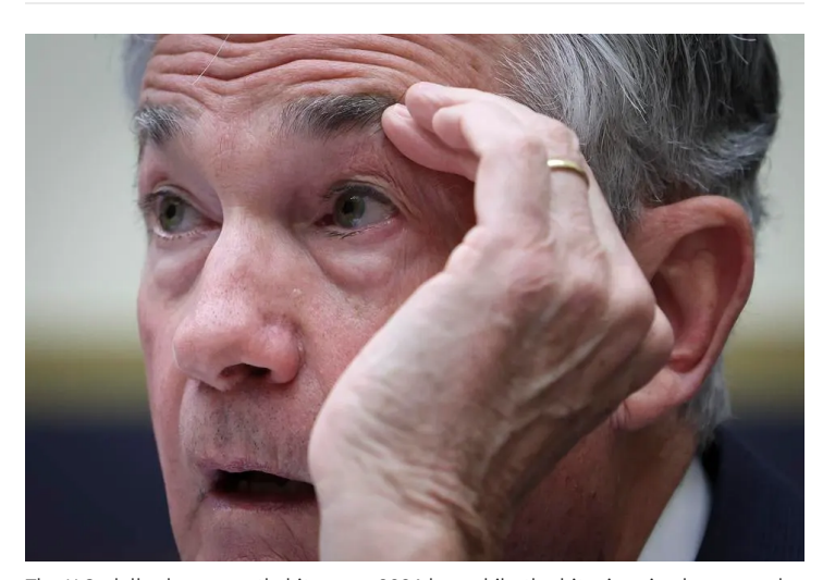
The U.S. dollar has recently hit a new 2024 low while the bitcoin price has surged so far this year... [+]

Best Labor Day Clothing Sales: Shop 70 Fashion Deals On Madewell, Athleta And More