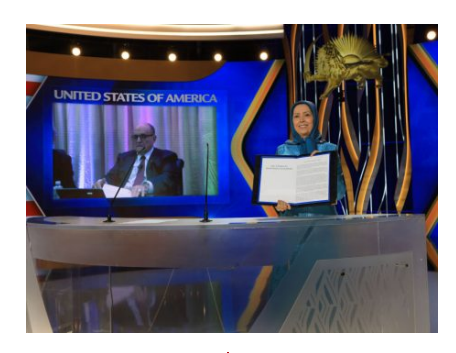
FOREIGN AFFAIRS | POLITICS