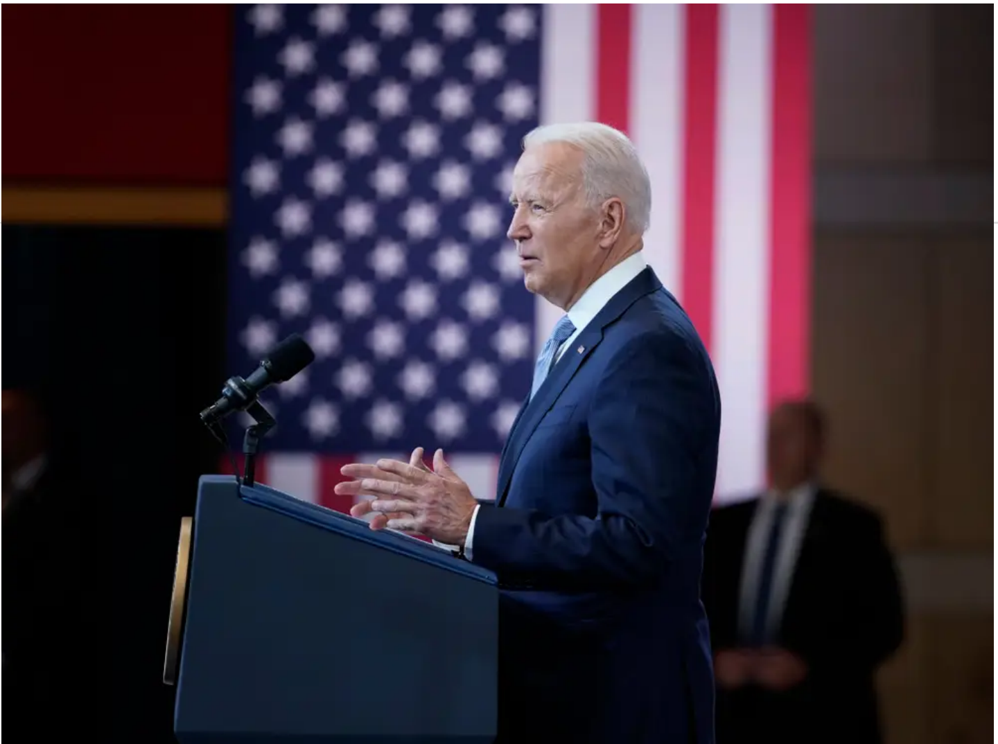
President Joe Biden delivers a speech on voting rights at the National Constitution Center in Philadelphia on July 13, 2021.