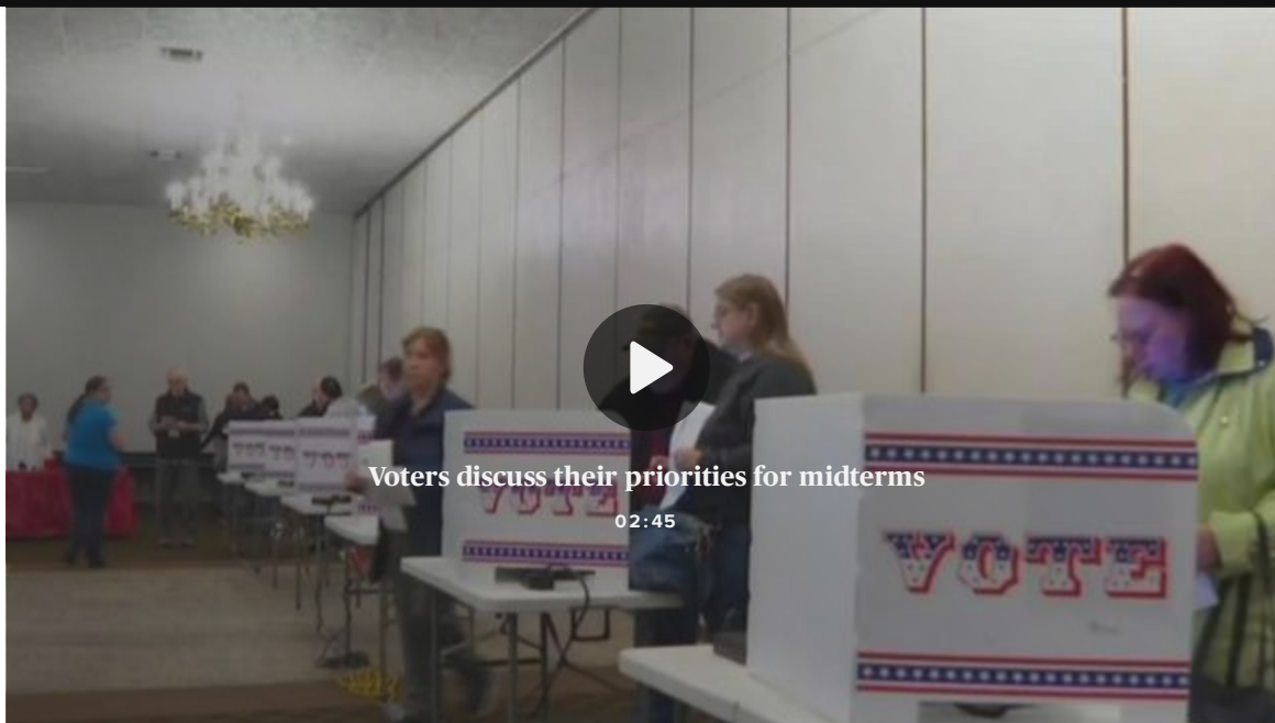
Voters discuss their priorities for midterms