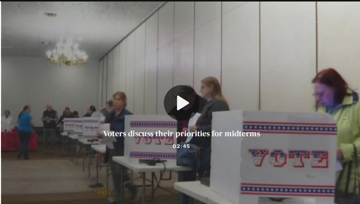
Voters discuss their priorities for midterms